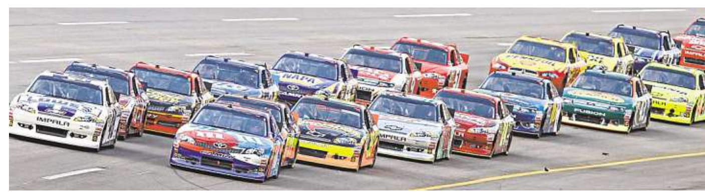
Drivers line up to start the Quaker State 400 at Kentucky Speedway on Saturday.

Brad Keselowski wins the Quaker State 400 at the Kentucky Speedway, C1